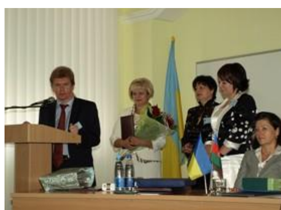
Representatives from Republic of Belarus

After the opening ceremony plenary meeting took place, where the participants discussed problems of the development of post-graduate pedagogical education.