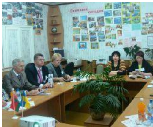
During the seminars and round table discussions in educational establishments of Borysivsky and Dzerzhynsky district, Minsk region