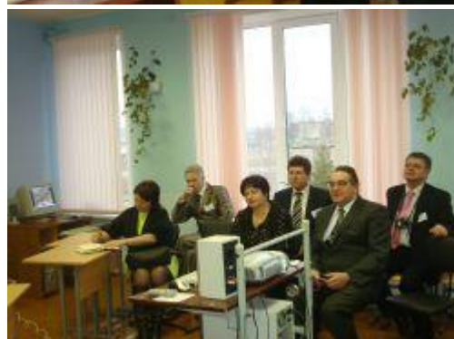
Learning of the experience of educational establishments of Minsk region by the delegation of educators of Kyiv region

Round table discussion on the question of development of educational system of Belarus Republic.