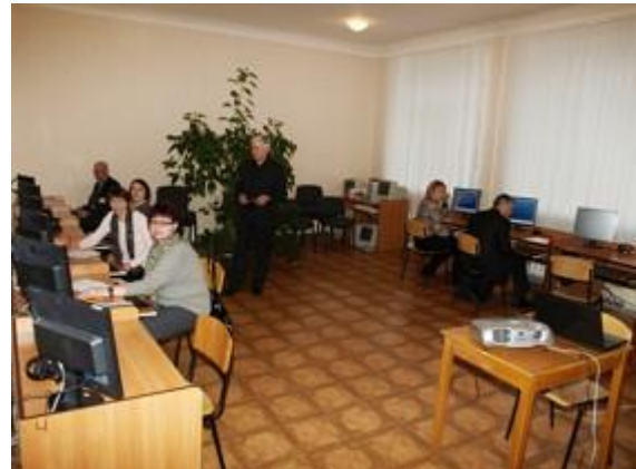
During the consultations in the center of information technologies