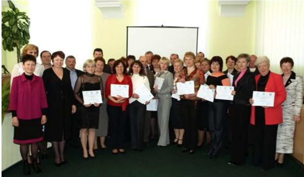
School principles (group 2), who had their training from 19th to 30th of April got their certificates, too

On April 6, 2010 28 school principles from Kyiv region started their training according to 80-hour training program "Teaching of principles of educational institutions"(The project "Equal access to quality education"). The participants completed the studies successfully and got their certificates