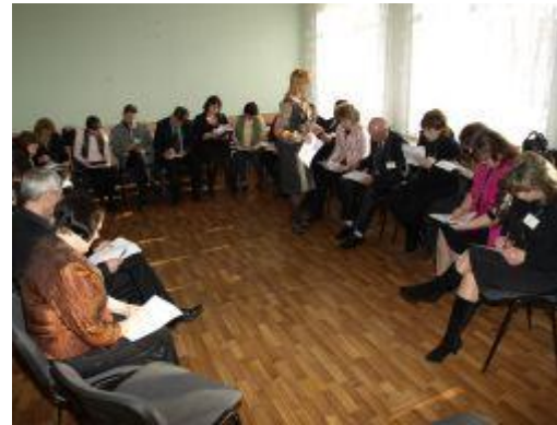
During the training sessions