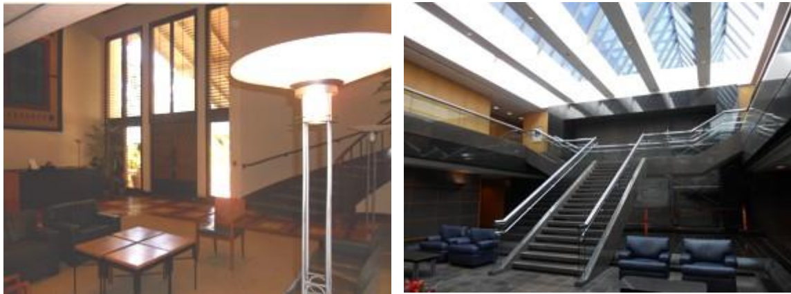
The main building of National University