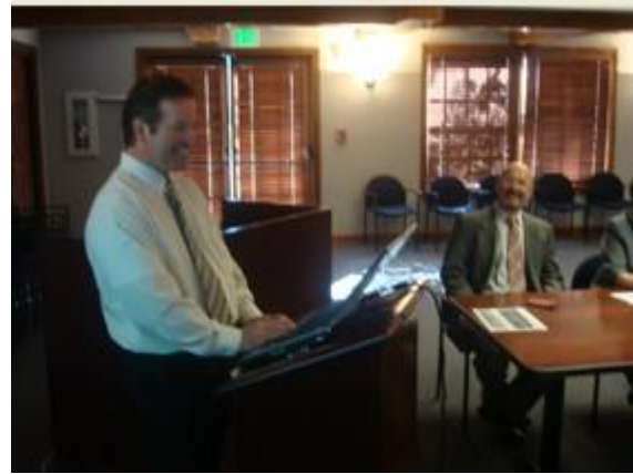
During the meeting at National Univerrrsity

The National University Library System has more than 315,000 volumes, including one of the largest e-book collections in the United States. The Library provides access to 87 electronic databases, over 24,000 full text journals, and various services for online users, including Journal Direct, Books Direct, RefDesk e-mail reference, and eReserves.