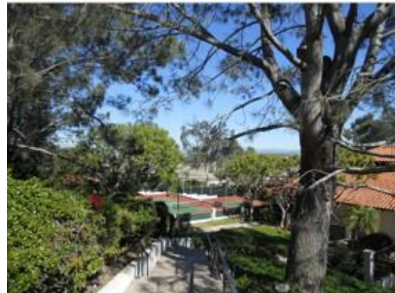
At the National University's campus