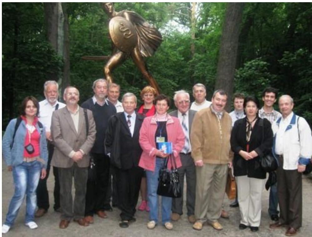
The participants of the conference went on excursion to the State dendrological “Oleksandria” Park of the National Academy of Science

On May 21, 2010 they took part in the regional event “Long live, Youth Science!”.