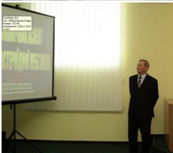
Klym Churyumov , PhD (Physics and Mathematics), professor of Kyiv State University (Ukraine), Academician of The National Academy of Science, (Ukraine) is presenting Physical and Chemical process, which takes place in tales and nucleus of comets.

European Union has launched spacecraft to Churyumov Comet with the aim of physical and chemical research.