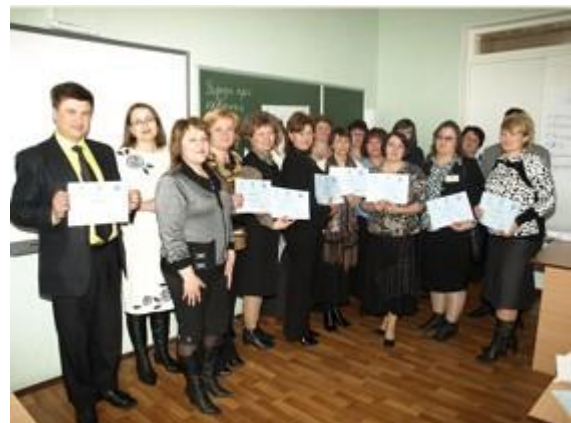
The training has been completed successfully!