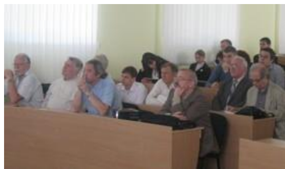
During the conference